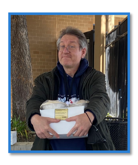
These delicious pies helped raise $1,100 for our music program!